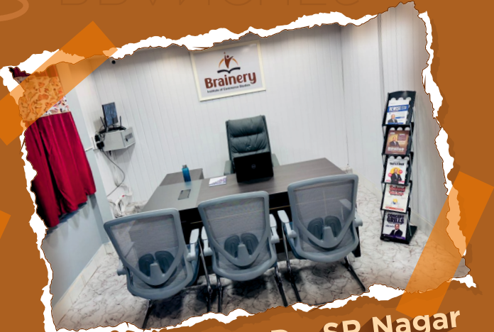
HYDERABAD - SR Nagar