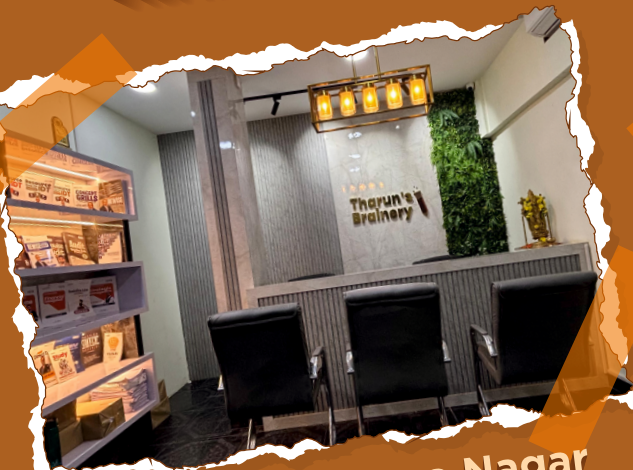
CHENNAI - Anna Nagar