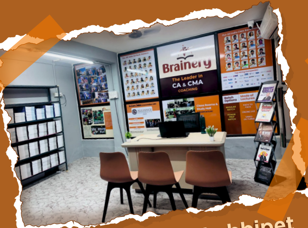
VIJAYAWADA - Labbipet