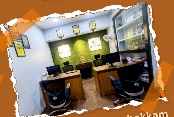
CHENNAI - Nungambakkam